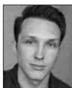
Carson Hampton Palmer