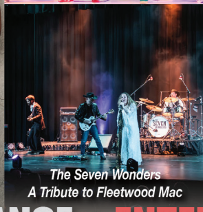
The Seven Wonders A Tribute to Fleetwood Mac