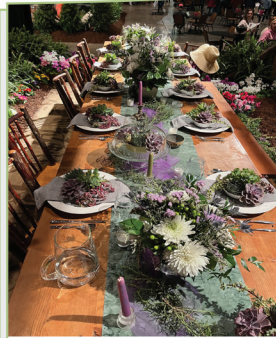
Spectacularly Floral Artistic Gardens

$20 at the Door $17 Online Tickets $5 Children Ages 5-12 FREE Ages 0-4