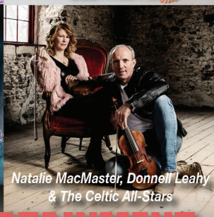
Natalie MacMaster, Donnell Leahy & The Celtic All-Stars