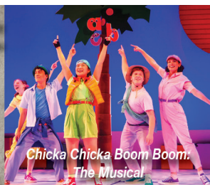
Chicka Chicka Boom Boom: The Musical